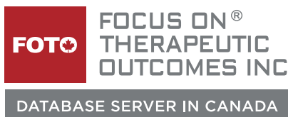
FOTO IS THE GLOBAL STANDARD FOR OUTCOMES MEASUREMENT